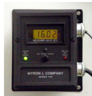
Resistivity Monitor (Ready Indicated)

DO NOT USE DI-WATER IF BOTH WATER TANK LEDs ARE ORANGE