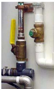
City Water Valve (OPEN Position)

NOTE: THE DI WATER SYSTEM MUST BE SHUT OFF AT THE END OF EVERY WORK/LAB SESSION