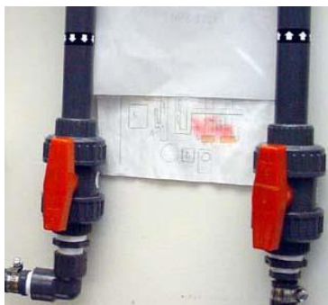
DI Water Valves (OPEN Position)