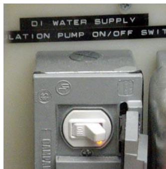
Recirculation Pump Switch (ON position)